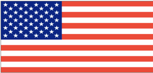
United States of America